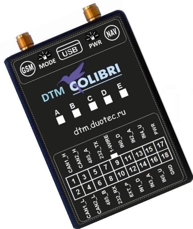
Fig 1. top view of the device.