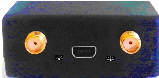
Fig 3. The front panel of the device.

GSM - connector for connecting an external GSM antenna.